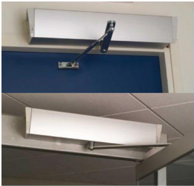
▲ Single swing doors