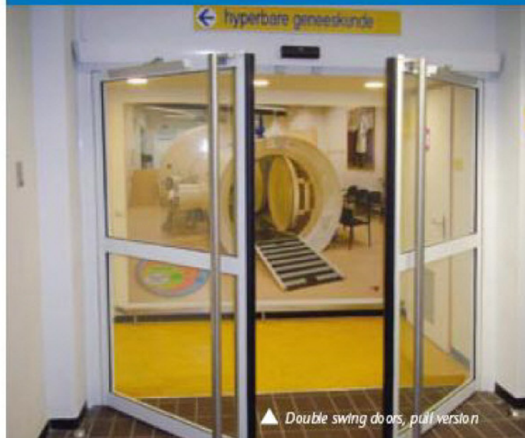
▲ Double swing doors, pull version